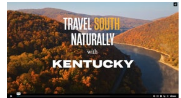
Video Pre-Roll Campaign