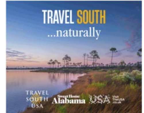
Digital Display Banners