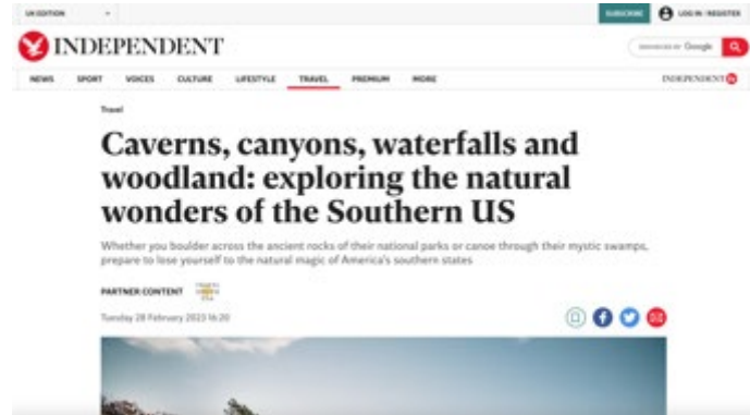
Independent native article