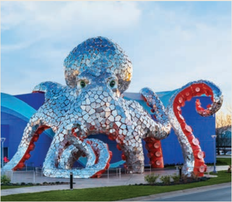
AQUARIUM AT THE BOARDWALK

Aquarium at the Boardwalk is one of the newest things to do in Branson and is unlike any other aquarium you’ve visited. Some features that visitors can expect to enjoy are more than 250 different animal species, an original 5D submarine adventure to the bottom of the sea; sharks, a 24-foot high Kelp Forest climbing structure for kids; stingrays, a gorgeous 16-foot view of a coral reef, two mirrored art installations that give the sense of infinite ocean life; lionfish, and more than 7,200 individual sea animals.