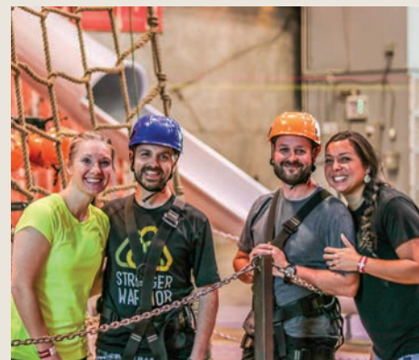
TOP: PAYNE'S VALLEY GOLF COURSE – ABOVE LEFT: BEYOND THE LENS ABOVE RIGHT: FRITZ'S ADVENTURE