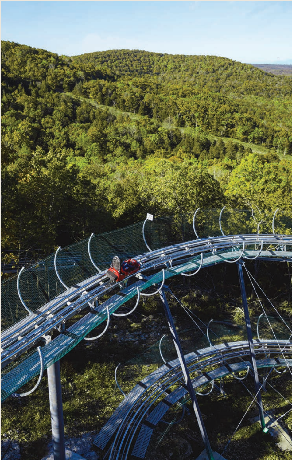
COPPERHEAD MOUNTAIN COASTER

Branson welcomed a new kind of nightlife experience in the heart of downtown. Summit bar and nightclub focuses on playing today’s hits with DJ driven music. Think “where the mountains meet neon forest.” A great place to meet, the bar lounge and dance club has just begun a new food journey with a menu designed around classic American Cuisine. Starting off with small-bites and some of your favorite appetizers, Summit aims to target the next generation of Branson visitors, with the ‘wow’ food and entertainment aspect being the main draw.