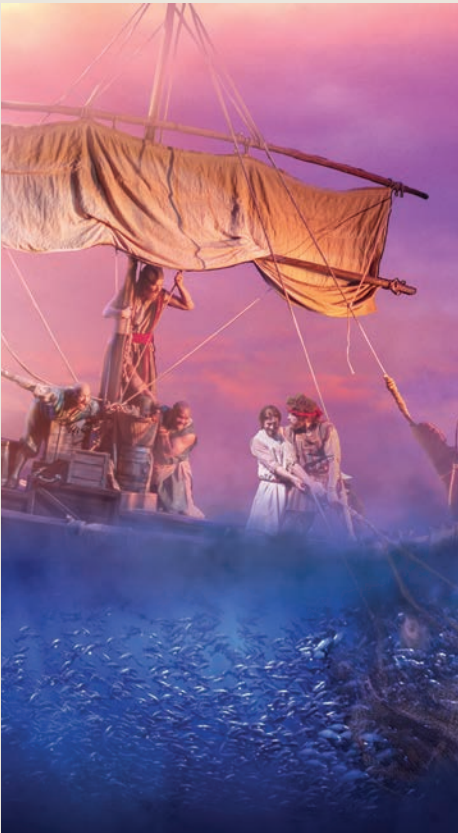
JESUS AT SIGHT & SOUND