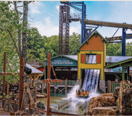
MYSTIC RIVER FALLS AT SILVER DOLLAR CITY