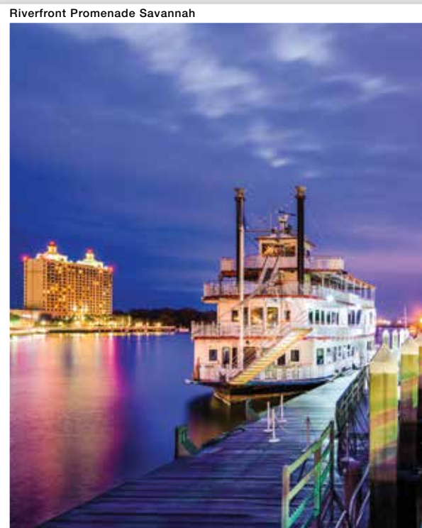
Riverfront Promenade Savannah