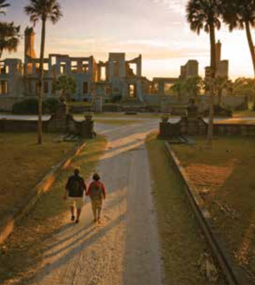
Dungeness Ruins, Cumberland Island