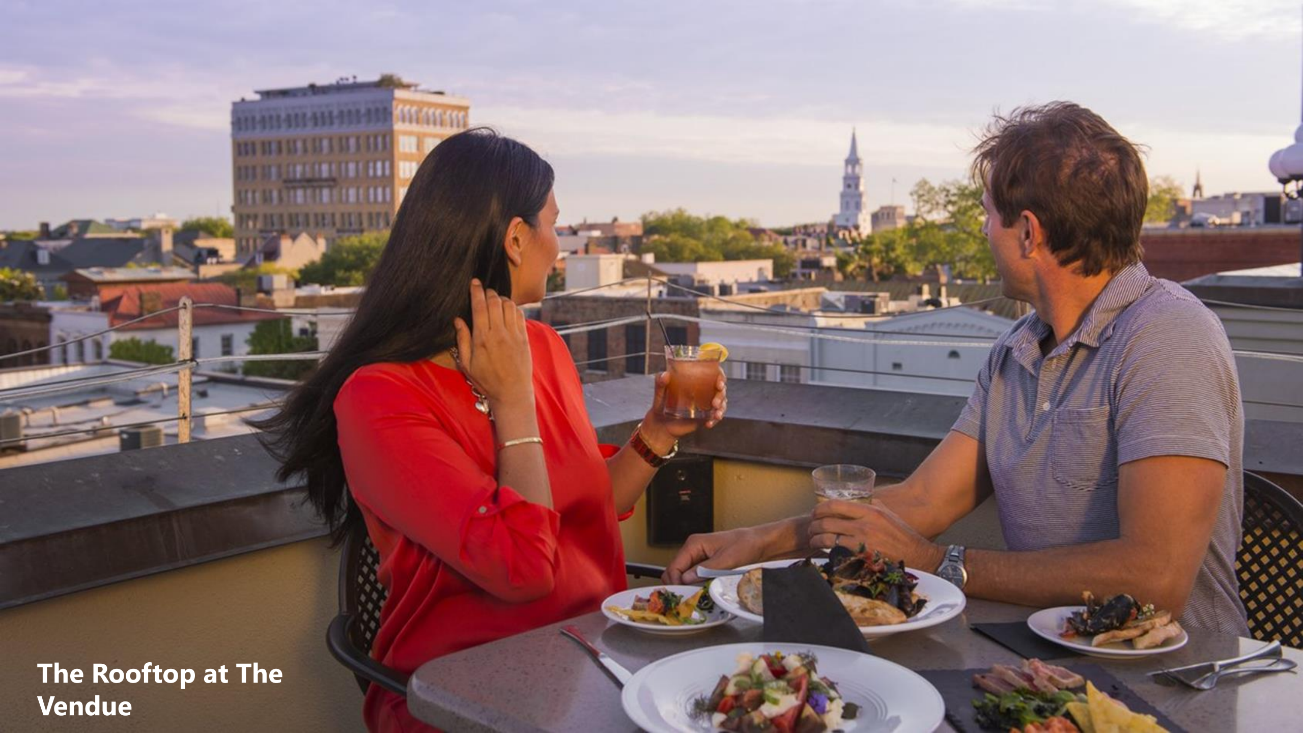
The Rooftop at The Vendue