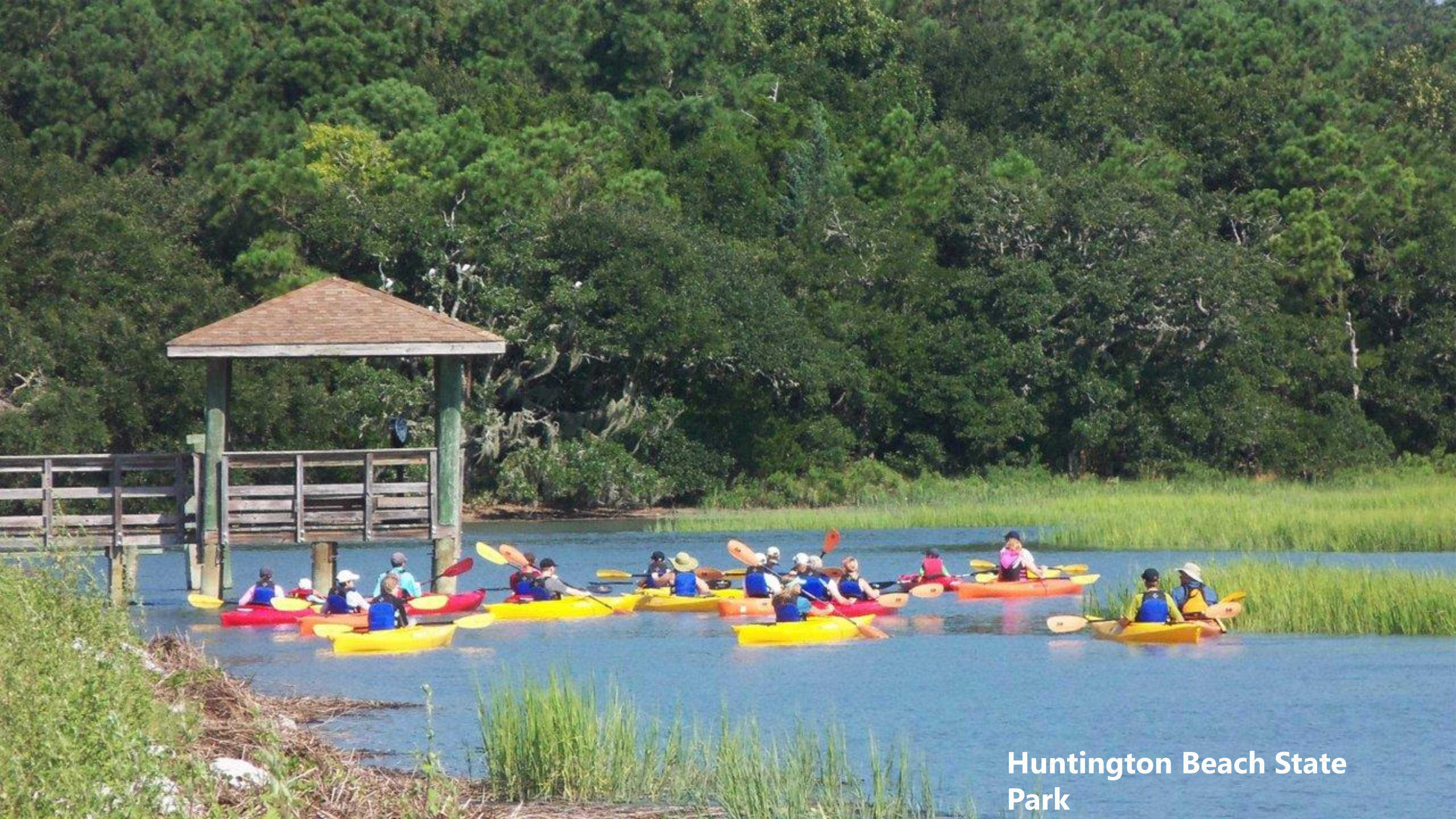
Huntington Beach State Park