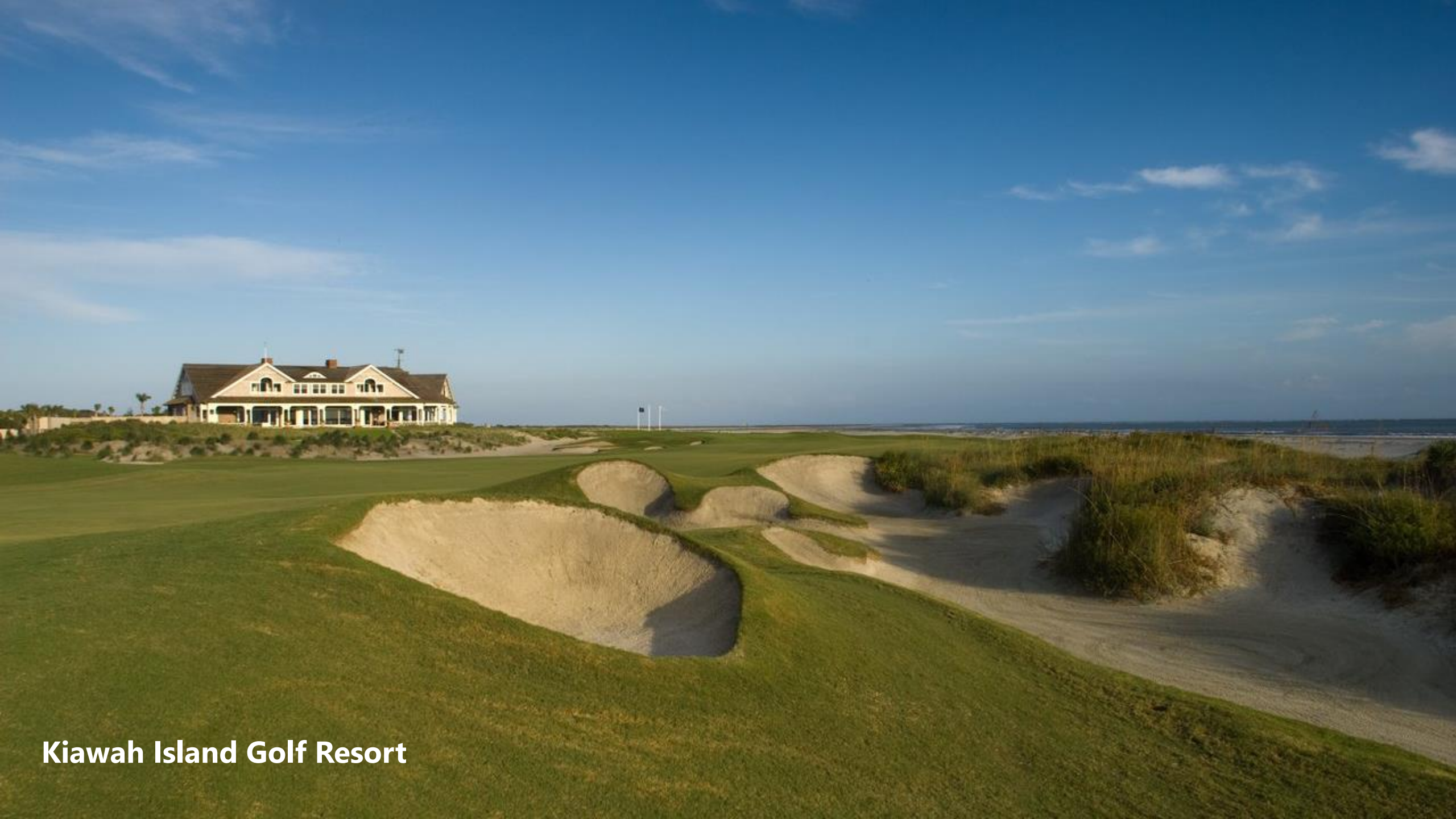
Kiawah Island Golf Resort