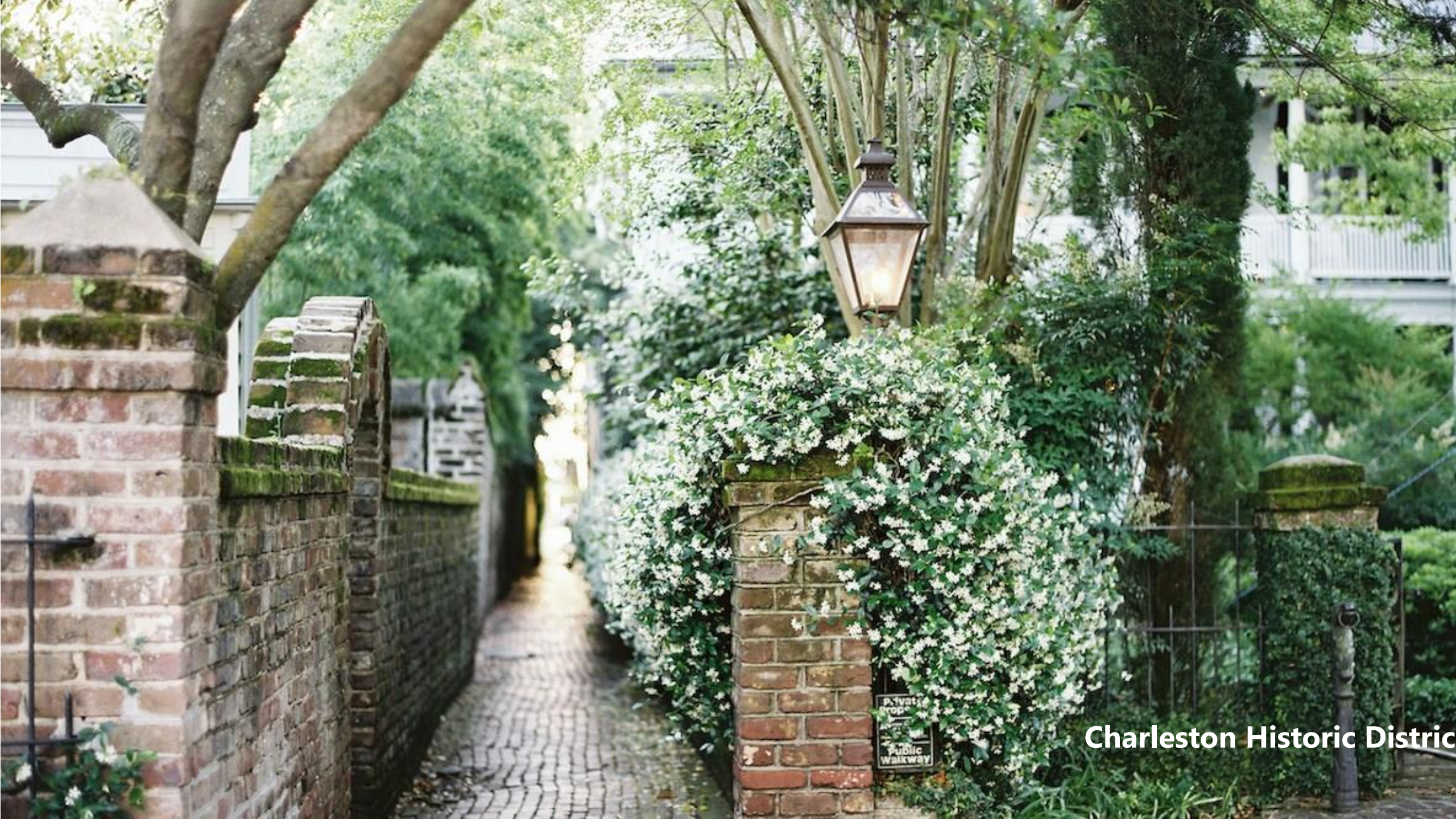
Charleston Historic District