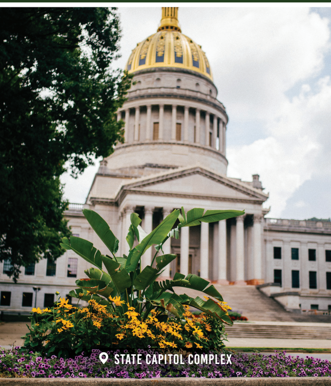
STATE CAPITOL COMPLEX