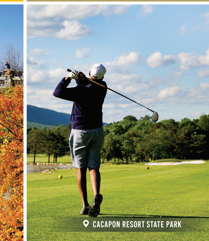
CACAPON RESORT STATE PARK