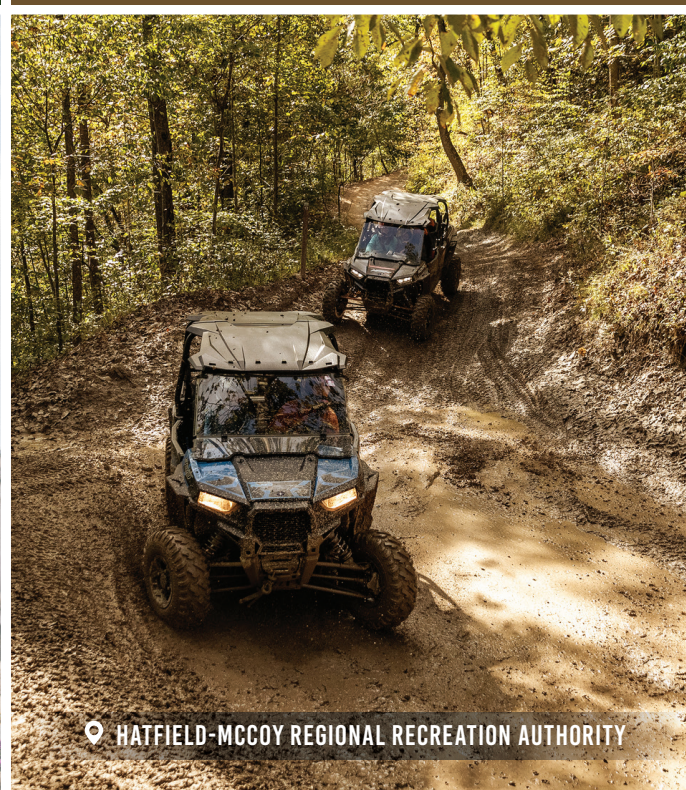
HATFIELD-MCCOY REGIONAL RECREATION AUTHORITY