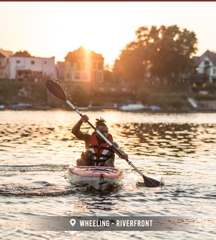
WHEELING - RIVERFRONT