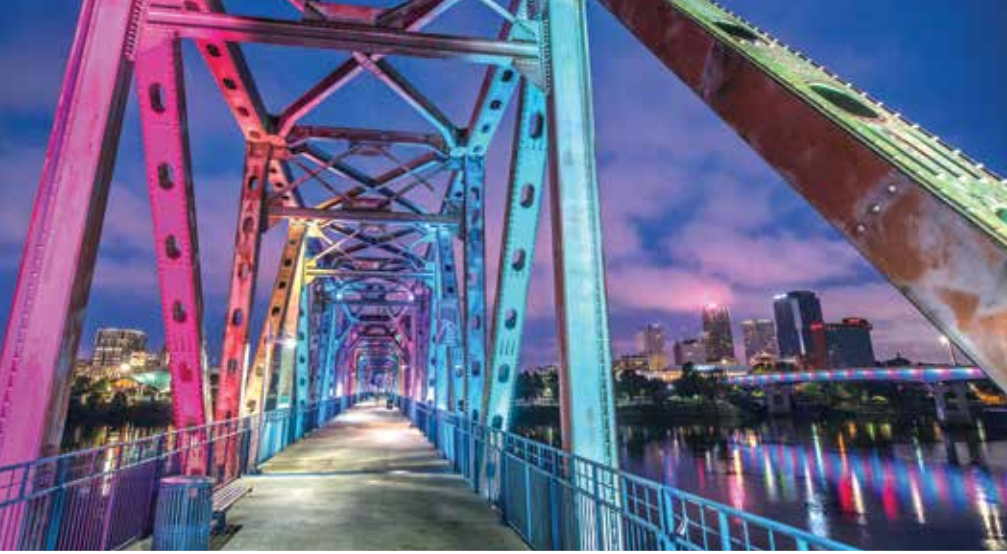
Little Rock Junction Bridge