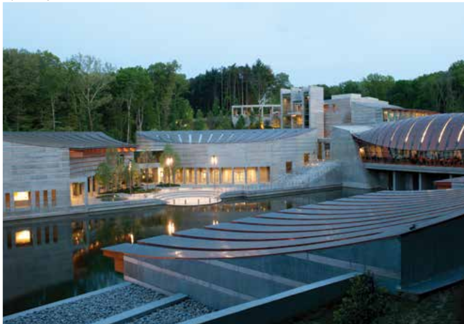
Crystal Bridges Museum Of American Art, Bentonville