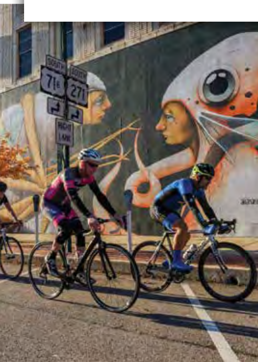
Road Bicycles Murals, Fort Smith