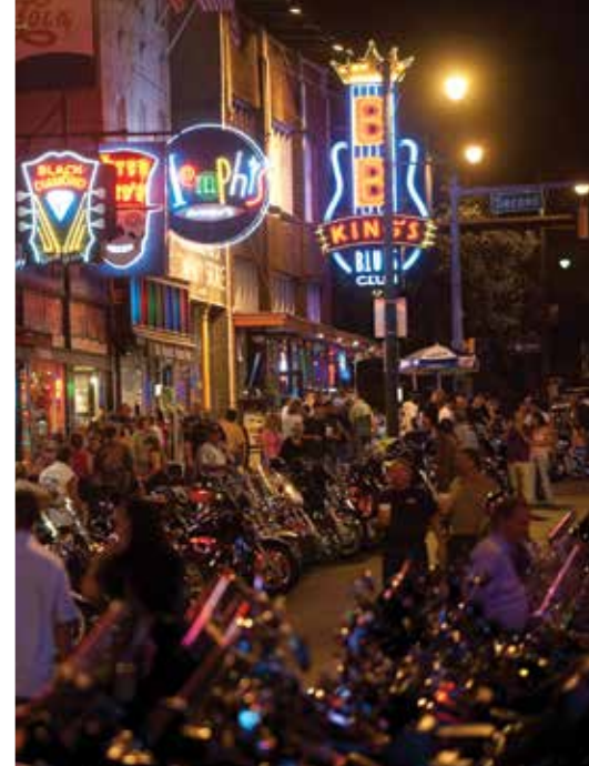
Memphis Beale Street Crowd