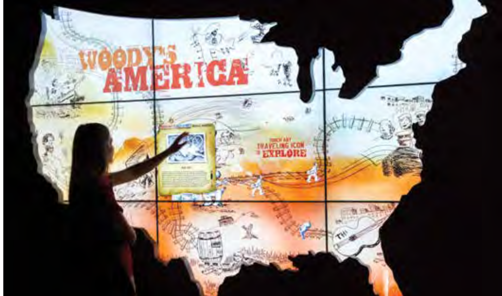
Woody Guthrie Center, Tulsa

largest collection of singing cowboys' memorabilia from the 1920's to present day. (Sunday – Friday option) Admission to the Museum is by donation. We recommend going through the Museum first and then donate what you are comfortable giving. Davis is full of natural beauty is home to the Turner Falls Park, one of the state's tallest waterfalls, with 77-foot falls that drop into a refreshing swimming hole. Full of wildflowers and breathtaking scenery, both Turner Falls Park and the Arbuckle Mountains are popular sightseeing areas in the region. If the timing is right and you are hungry for good BBQ, be sure to eat at Smokin' Joes Rib Ranch (Davis). Then stop to satisfy your sweet tooth with special treats at Bedre Chocolate. This is the only Native American owned chocolate factory in the world, or do not miss the Arbuckle Original Fried Pies before you continue onto Duncan (2-hour drive). Once in Duncan, if craft breweries are your thing, Kochendorfer Brewing Co. is worth a stop before checking in your hotel for the night.