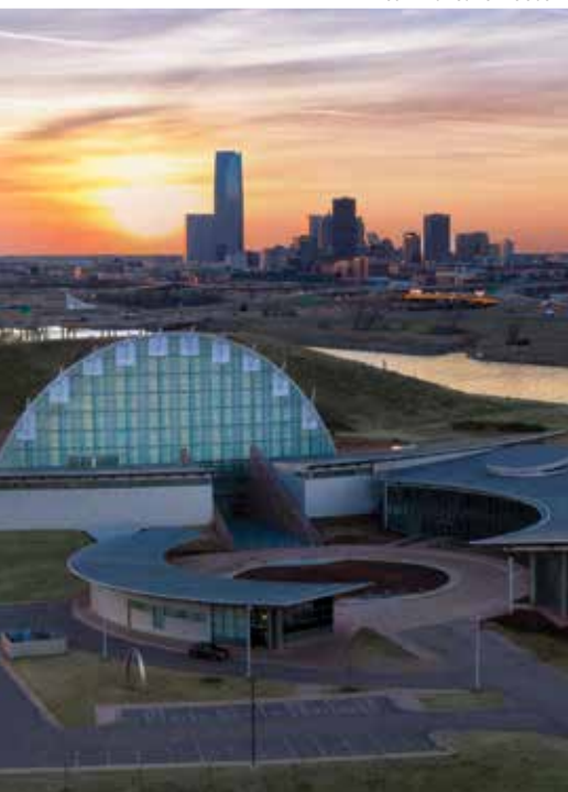
First Americans Museum