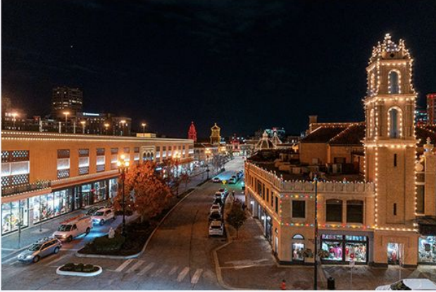
(Country Club Plaza)

Missouri offers many opportunities to create memories and traditions over Thanksgiving. Holiday lights in downtown Kansas City are a beautiful sight, and for many families, the season is not complete without them. A flip of the switch on Thanksgiving evening reveals thousands of jewel-toned lights outlining every dome, tower, and window in Kansas City's Country Club Plaza. The lights illuminate the 15-block shopping district. In addition, The Raphael Hotel in Kansas City boasts incredible views of Kansas City's dazzling Country Club Plaza light display. The lighting ceremony has been a Kansas City tradition since 1930.