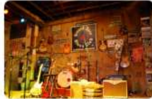
Grand Zero Blues Club, Clarksdale, Mississippi

I byen Greenwood ble en ny rute med 22 spesielle stoppesteder introdusert i 2016. Ruten introduserer besøkende for personligheter og utvalgte steder knyttet til musikk- og countrymusikk, biografier/historier og litteratur. Ruten er knyttet til et nettverk av besøkende som kan brukes til å skaffe til koder på de forskjellige stoppene og rulle forhåpninger.