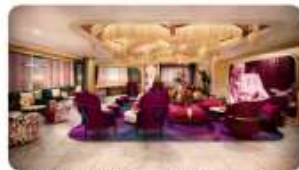
Dolly Parton-utstilling i Songwriter Hotel i Nashville, Tennessee

I den gamle Songwriter Hotel i Nashville, der Dolly Parton er tema, forteller får også et museum med den største Dolly Parton utstillingen til dags dato, hvor du kan komme tett på Dolly Parton kamere og personlige historier.