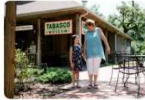
Tabasco Restaurant 1868 på Avery Island i Louisiana

I Louisiana kan du oppleve den nye Louisiana Hot Sauce Trail, som har 17 stopp på steder som selger hot sauce rundt om i delstaten. Ruten setter søkelyst på endeligproducenter av hot sauce ved å besøke Tabasco og spesielle steder som Hot Sauce Shrine i Ada Mych's House , en utstilling og fotograf utstilling fylt med hendelser av hot sauce-fancker.