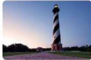
Morgensolnng ved Cape Hatteras fyr som ble bygd i 1849 og ligger i Outer Banks i Nord-Carolina

I sommer gjenspeiler det ikoniske Cape Hatteras Lighthouse på kysten av Outer Banks uten en omfattende restaurering. Fyret er et av de mest erkeoplyste og avbildede fyrene i sin land og fotograf. Med sine 50 meter er fyret det høyeste muretsfyret i USA, og det kan ses fra i over 25 kilometer i alle retninger. Som besøkende kan du gå opp til toppen av fyret og nyte din vakre utsikt.