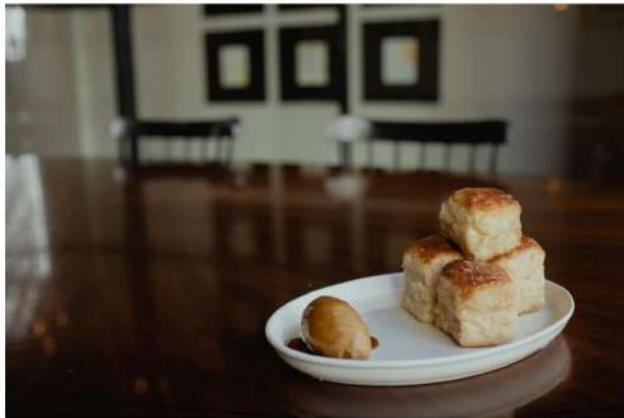
Angel biscuits get their signature lift from three kinds of leavening. ELISE FERRER