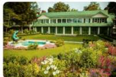
Fontene foran Reynolds House Museum of American Art i Winston-Salem , Nord-Carolina. Museet er et av landets fremste og viser kunstsamlinger som strekker seg over tre århundrer

I byen Winston-Salem i Nord-Carolina kan du oppleve Reynolds Gardens , som tilbyr en kombinasjon av Kataiske anlagte hager, rosebed og skogklødd turlier.