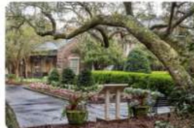
Bellingrath Gardens and Home i Mobile , Alabama

Sør for Mobile i Alabama kan du oppleve Bellingrath Gardens and Home , som er utstykket med store områder med fargerike esdaleer og utsikt over Fowl River .