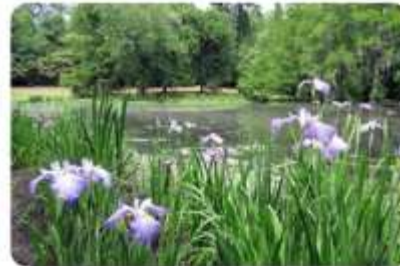
Iris i Swan Lake Iris Street i byen Sumter, Sør-Carolina

Les mer om Azaleablonstringen i Louisiana HER