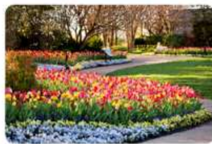
Blomstring i Cheekwood Estate & Gardens i Atlanta , Georgia

Atlanta Botanical Garden : Teier sitt 50-årsjubileum i år med utstillingen «Atlanta SUPER Blooms!», der hagen byr på over 140 000 tulipaner og påsketuljer. Utstillingen kan oppleves til 30. april.